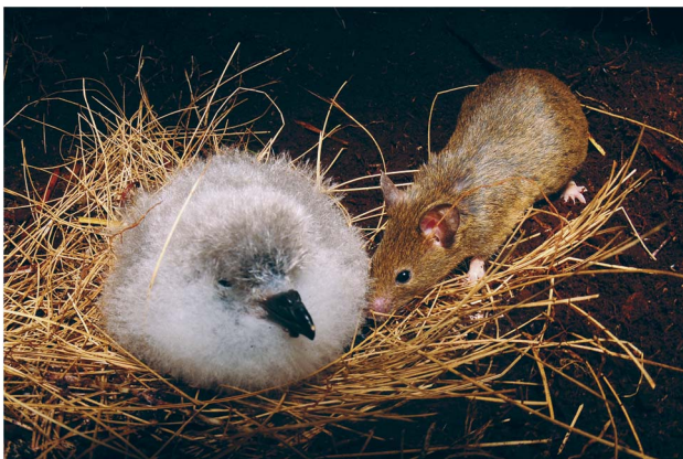
Fig. 3. Despite being repeatedly investigated by mice, this common diving petrel chick (here 15 days old) was never wounded or attacked.

Only two common diving petrel burrows were found within 200 m of the station in November 2013. Both burrows had new nest material in the chamber with an