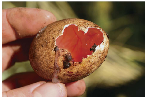
Fig. 1. Evidence of mouse incisor marks on a freshly broken broad-billed prion egg shell at Snoekgat cave in September 2014.

Despite extensive searches, only 18 broad-billed prion nests with an incubating bird were located by mid-September