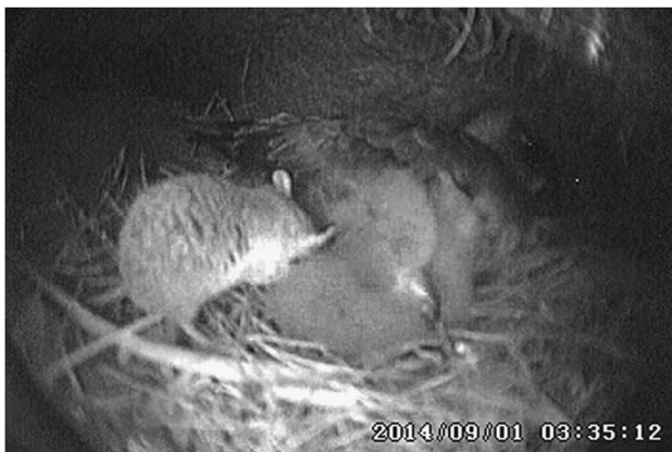
Fig. 7. A mouse attacking a newly hatched Atlantic petrel chick with the parent sitting alongside.

lower rump, characteristic of wounds seen on freshly dead chicks commonly found in burrows by fieldworkers since 2004. On average 1–3 mice would attack at one time (mean 1.9 \pm 0.7 mice) and kill the chick within 4.5 \pm 4.0 hours (range 1.5–13.1 hours). In one nest, the chick was hatching when a mouse pulled off the cracked eggshell, attacked the wet chick and killed it within 4 hours. Some adults dropped their wings to better cover the newly hatched chick, but the mice pushed underneath the wing, eventually causing the adult to move aside. All attacks were initiated at night, but in two nests mice returned during the day to kill the injured chicks (Table IV). A one minute video of an Atlantic petrel chick being attacked by a mouse is available at https://youtu.be/VVehgRcfO98 .