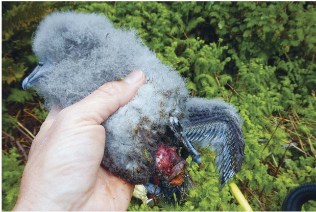
Fig. 2. A broad-billed prion chick (~2 weeks old) found alive, but with severe mouse wounds, in its burrow on the north-east slope of 960 Hill, Gough Island, in October 2013.

2014: seven nests in Snoekgat cave and 11 nests in burrows on the path to the Golden Highway. By 28 September 2014 all of the nests at Snoekgat cave had failed with evidence of mouse incisor marks on freshly broken egg shells (Fig. 1) and no evidence of any eggs having hatched. Only two of the 11 burrows on the path to the Golden Highway contained chicks by 15 October 2014, and both had failed by 6 November 2014 (18% hatching success and 0% breeding success). On 29 October 2013, a small prion chick (~2 weeks old) was found alive, but with severe mouse wounds, in its burrow on the north-east slope of 960 Hill (Fig. 2).