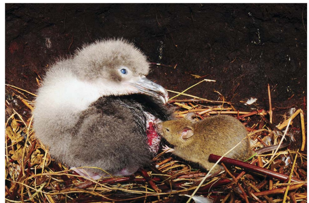
Fig. 4. This great shearwater chick (here 10 days old) died 3.3 days after first being attacked by a mouse.

The chicks hatched in the remaining six filmed nests and were left alone after 3.9 \pm 0.6 days (range 3.1–4.5 days). One chick was wounded on the lower rump by a single