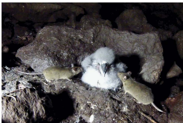
Fig. 5. Mice attacking a MacGillivray's prion chick (here ~20 days old) in Prion Cave.