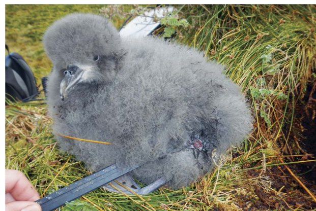
Fig. 6. A grey petrel chick (2 weeks old) with a mouse injury.

mouse 9.4 days after hatching. Following repeated attacks over 3.3 days by up to three mice at a time, the chick died (Fig. 4). When first attacked, this chick appeared in good health and had been fed by a parent on two occasions since being left alone at 4.3 days old. Although the other five chicks were frequently visited and occasionally agitated by mice, none was wounded and all survived to fledge (nests were monitored with a burrowscope after the cameras were removed). Great shearwater fledgling success was 60% and breeding success was 44% in 2014 ( n = 147 nests, Table II).