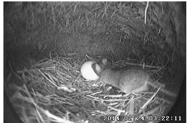
Fig. 9. A mouse predating on a temporarily neglected great shearwater egg.

In winter, mice have limited food resources (Cuthbert et al. unpublished) and the winter-breeding petrels were worst affected by mice, with chicks hatching in early winter (grey petrels) having a higher chick survival rate than chicks hatching in mid-winter (Atlantic petrels) or late winter (broad-billed prions, Fig. 8). Other winter-breeding species have not been studied because of difficulty locating their burrows, but late winter breeders, such as little shearwaters and great-winged petrels ( Pterodroma macroptera Smith) (Table III), are probably also severely affected by mouse predation.